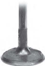
Intake Valve after P.i. Treatment