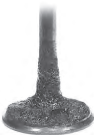
Intake Valve before P.i. Treatment