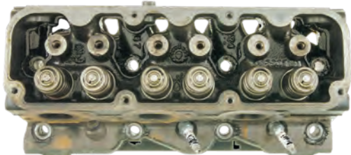
Cylinder head after cleanup with AMSOIL Engine and Transmission Flush. The valve springs and push rod openings are noticeably cleaner, with fewer sludge deposits. The manufacturer's stamping is more easily seen.