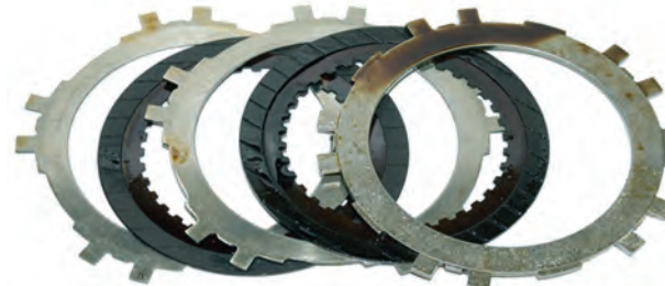
Automatic transmission clutch plates after cleanup with AMSOIL Engine and Transmission Flush reveal lighter glazing and varnish.