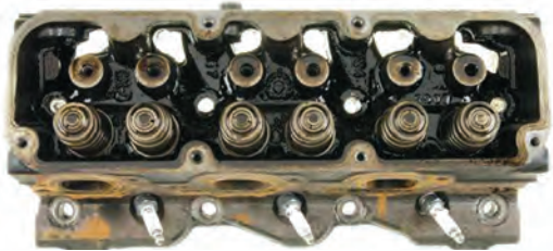
Cylinder head pre-cleanup. Note the sludge deposits on and around the valve springs and push rod openings.