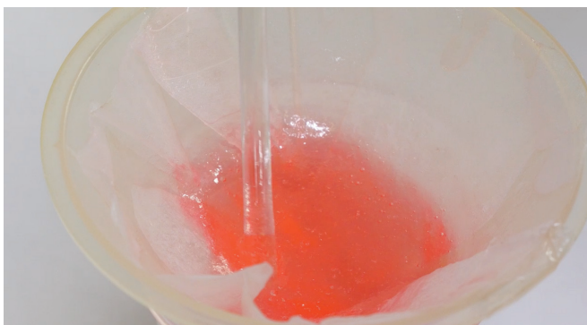
Wax formation in untreated diesel fuel plugs a coffee filter.