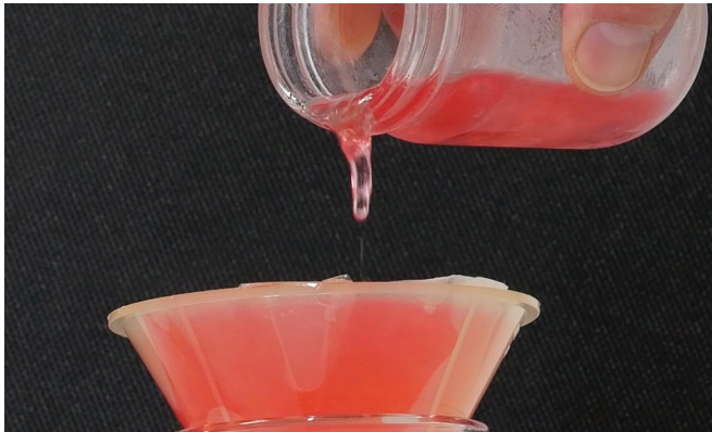
Wax formation in untreated diesel fuel resists pouring.

lowers the cold filter-plugging point (CFPP) by up to 40°F (22°C) in ULSD.