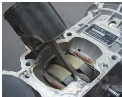
The pistons suffered only minor scuffing.